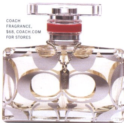
COACH FRAGRANCE, $68, COACH.COM FOR STORES