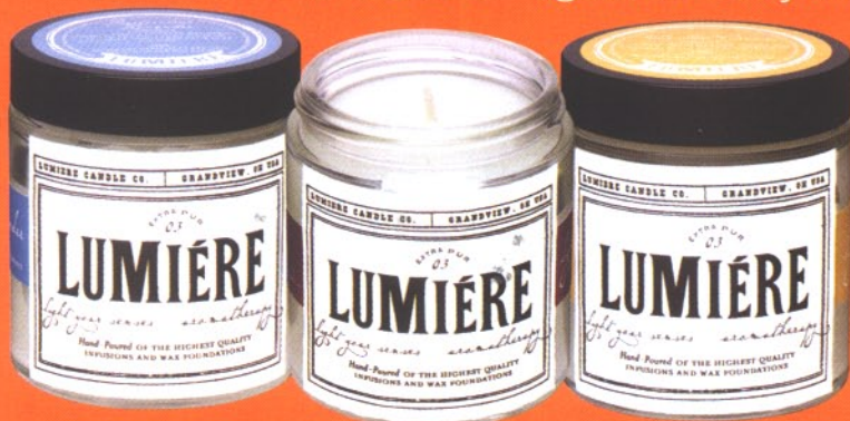
LUMIÈRE GIFT SET IN RESTORATIVE LAVENDER, WINTERBERRY, AND VANILLA CREAM. $28, LUMIERECANDLECO.COM

is girly, minimalist, old-fashioned, or super-modern, these vaguely vintagey candles somehow manage, Zelig -like, to fit right in. The scents are sweet and subtle—again, loved by all.